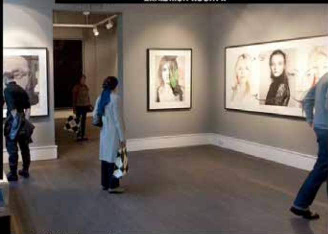
Exhibition Room III