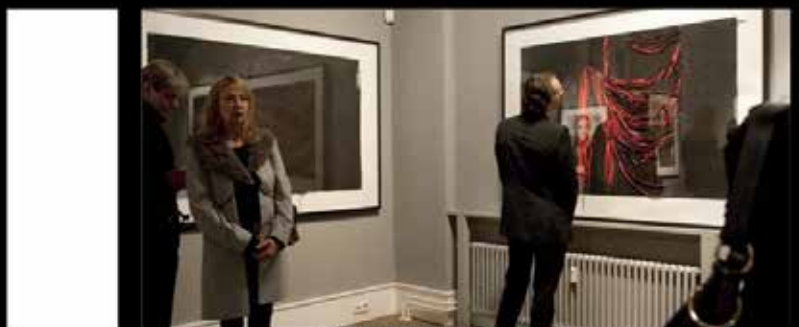
Exhibition Room IV