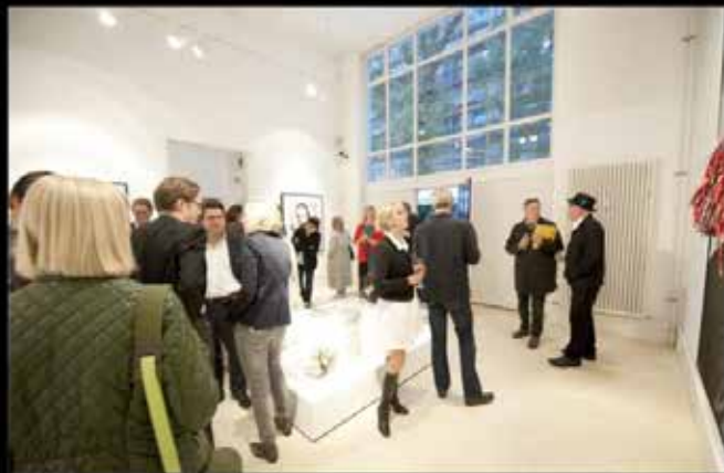
Exhibition Room II