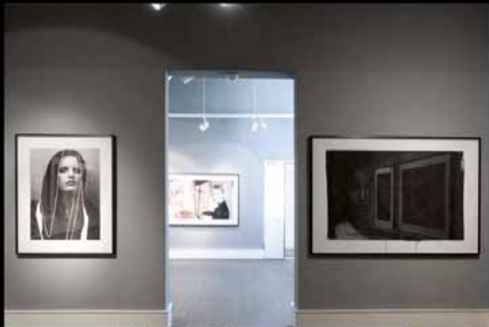
Exhibition Room IV